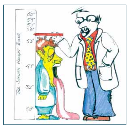
*Your Snellen height is normal so I pronounce you 100% fit!"