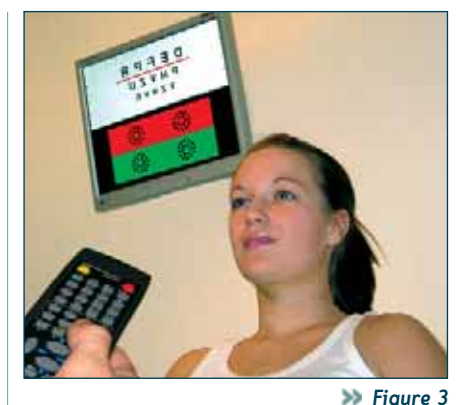
Computer-based test charts such as Test Chart 2000 offer the clinician an unprecedented range of visual assessment tools

Projector charts offer a little more flexibility although the selection of charts is still rather limited and their design frequently fails to conform to current